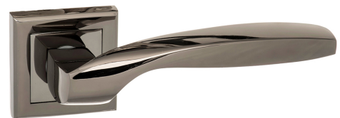
Product Finish Pictured: Black Nickel